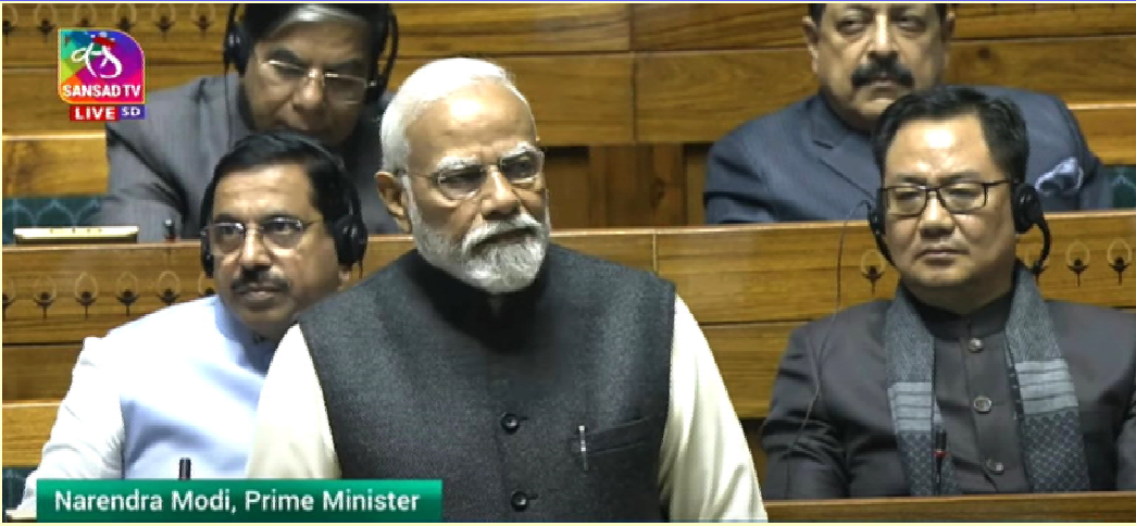
Narendra Modi, Prime Minister

Stressing the need for a strong opposition, the Prime Minister said that dynastic politics is a cause for concern for the Democracy of India. Throwing light on the meaning of dynastic politics, PM Shri Modi explained that a political party which runs a family, prioritizes its members, and where all decisions are taken by the family members is considered dynastic politics